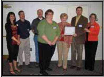
Neffsville Mennonite Church Ministry Team.