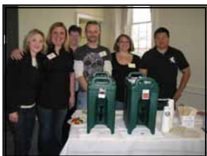
Starbucks of Lititz donated coffee and volunteers!